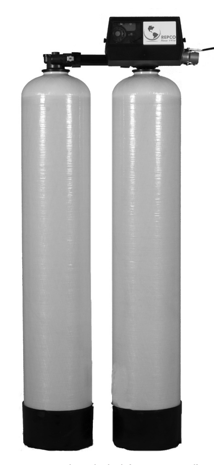
Brine tank included (not pictured)